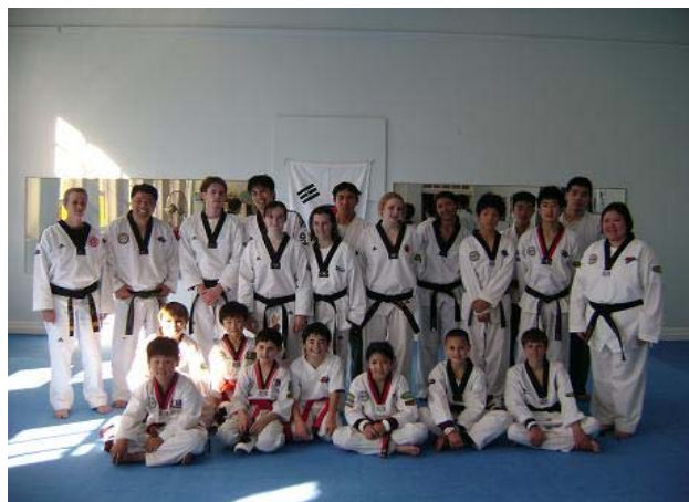
Photo above was at the Balmain state training

There will be no state training in September due to the national tournament.